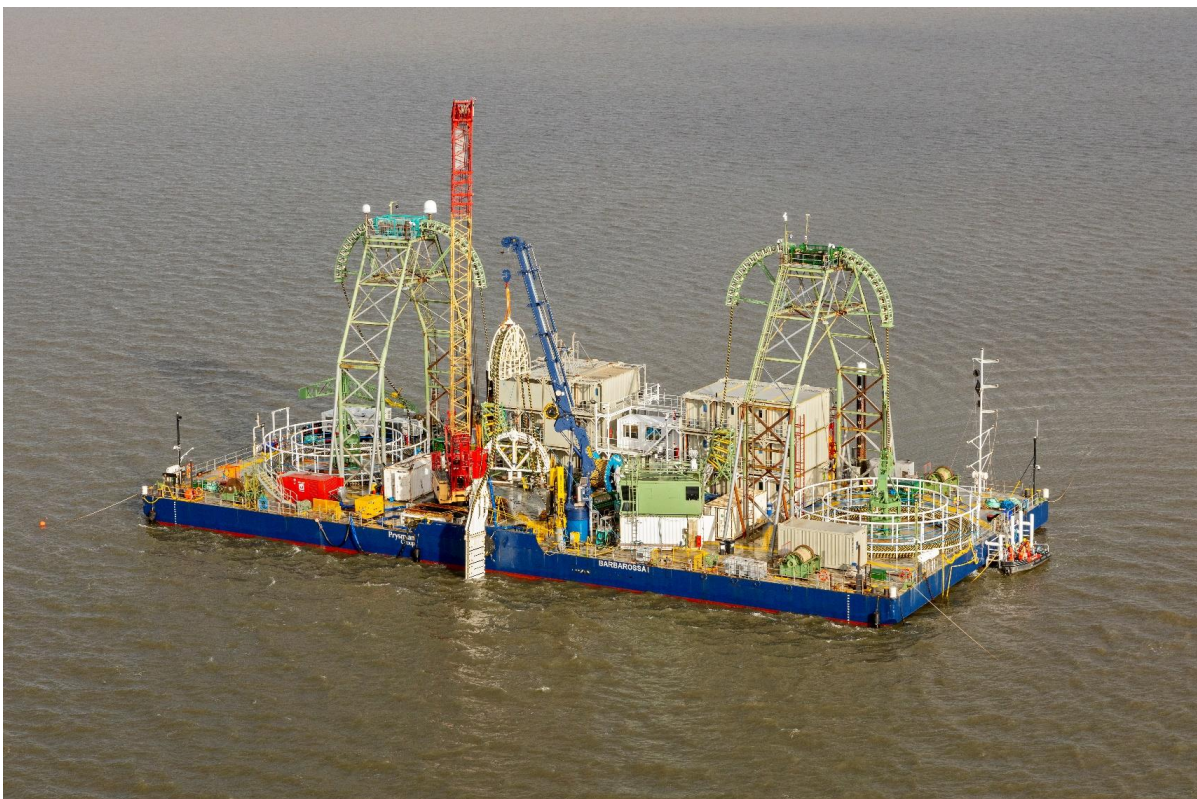
CABLE LAY BARGE